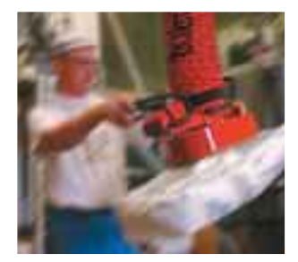
The vacuum tube lifters are easy to install and can be adapted to lift virtually any object – for instance boxes, sacks, panes of glass, sheet metal, stone slabs, drums, barrels, cans, computers etc.